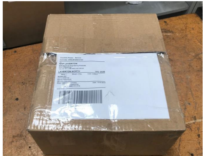
✓ Freight stickers adhered to outer carton, not product packaging