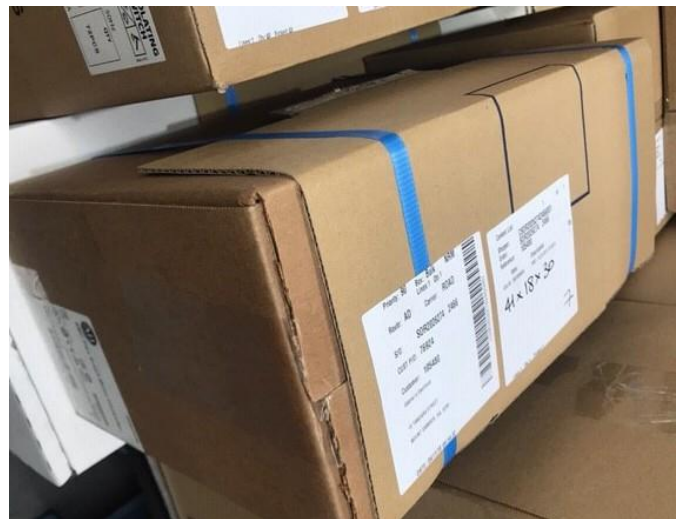
✓ Additional cardboard wrapped around product packaging, allowing freight stickers to be adhered to outer carton