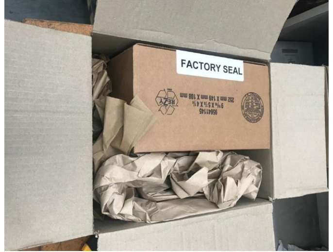
✓ Products protected with bubble wrap or packing material inside an outer carton